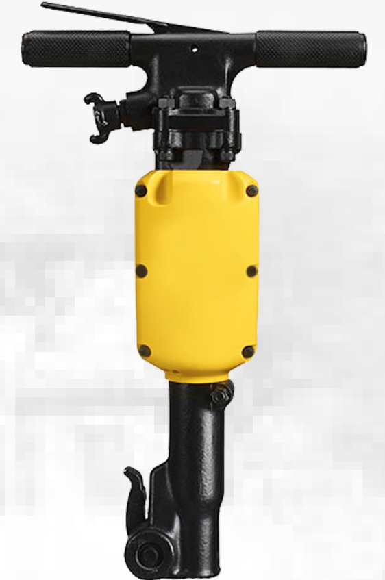
TEX 20 PS