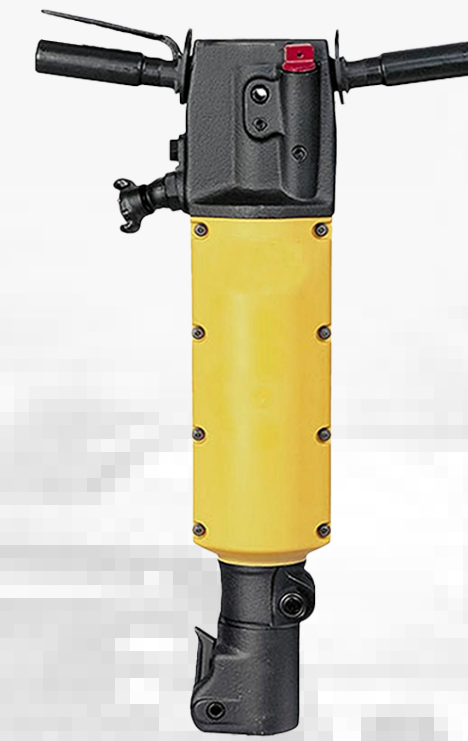
TEX 33 PE