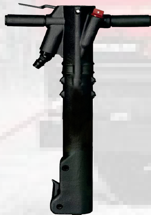
TEX 20 PS