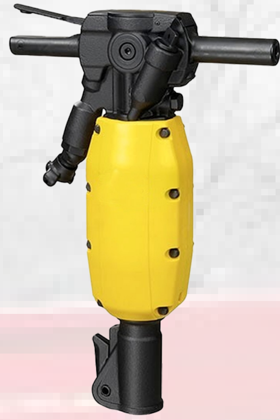
TEX 140 PS