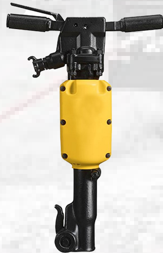
TEX 21 PE