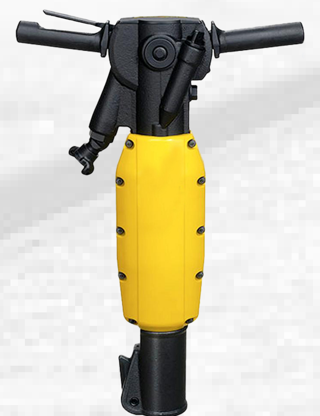
TEX 280 PE