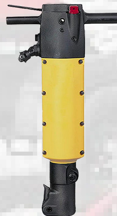
TEX 39 PS