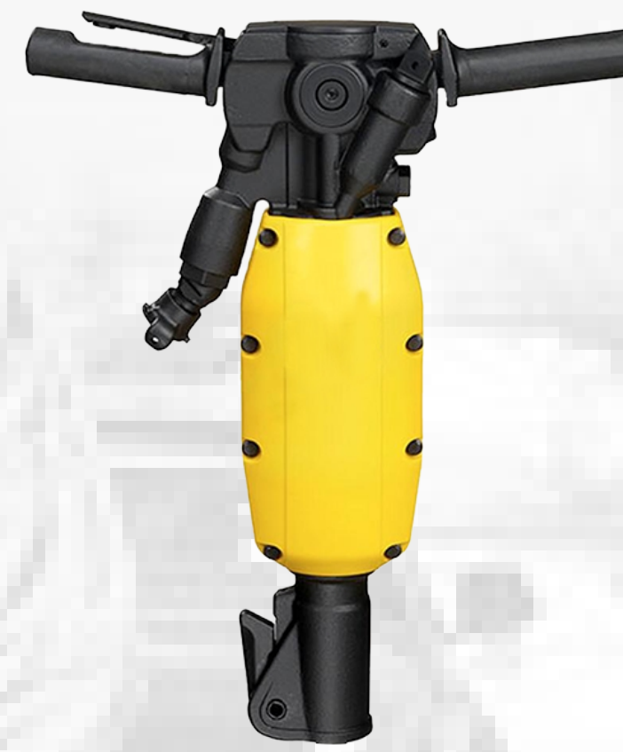
TEX 150 PE