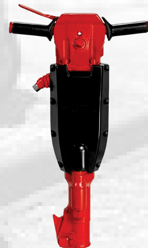
CP 1260 SVR