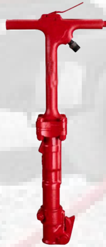
CP 0112 EXT