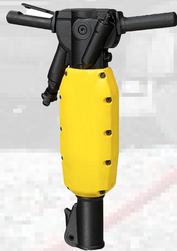
TEX 190 PE