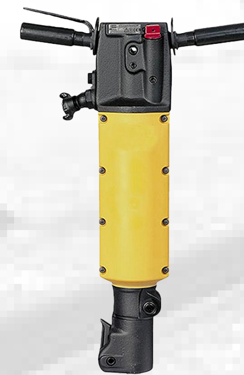
TEX 40 PE

RMT pneumatic breakers are available in weights, ranging from 35 lb to 90 lb class (20 kg to 41 kg) . The hammers are available with different shank size, varying from 25 mm to 32 mm shank (1" to 1¼") . These air tools are capable of light, medium and heavy duty jobs such as demolition, construction, renovation, road construction, bridge work and street repairs. Depending on the job in hand, users will find the most suitable breaker in RMT range . Being considered as the "manufacturer of high quality Paving Breakers from India", all our breakers are manufactured with the goal of providing "Operator's safety, maximum power, maximum durability, easily serviceable and affordable price"