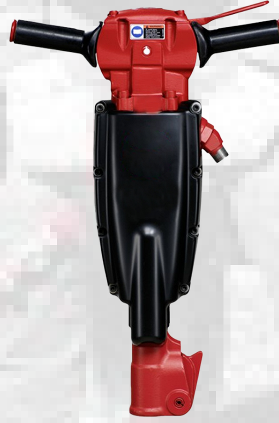
CP 1210 SVR